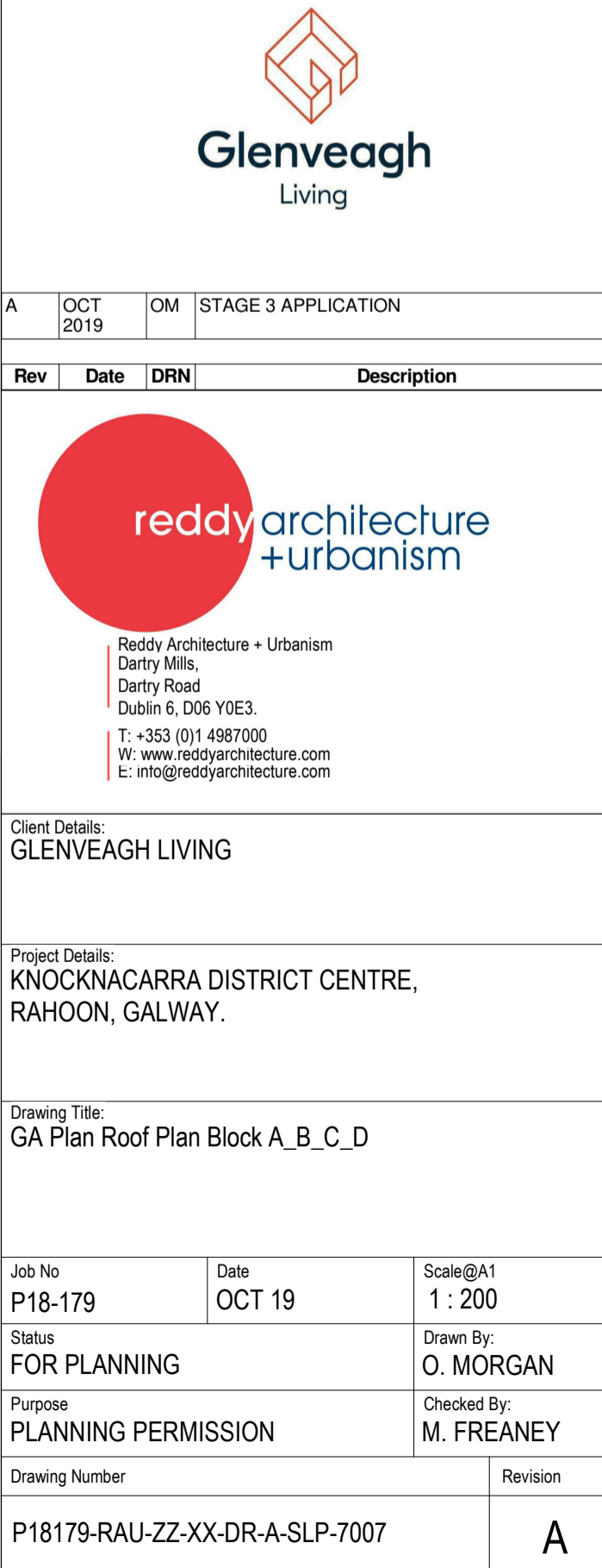
1 Roof Plan Level 07 Block A_B_C_D 1 : 200

MATCHLINE DRG. REFERENCE P18179-RAU-ZZ-XX-DR-A-SLP-7106